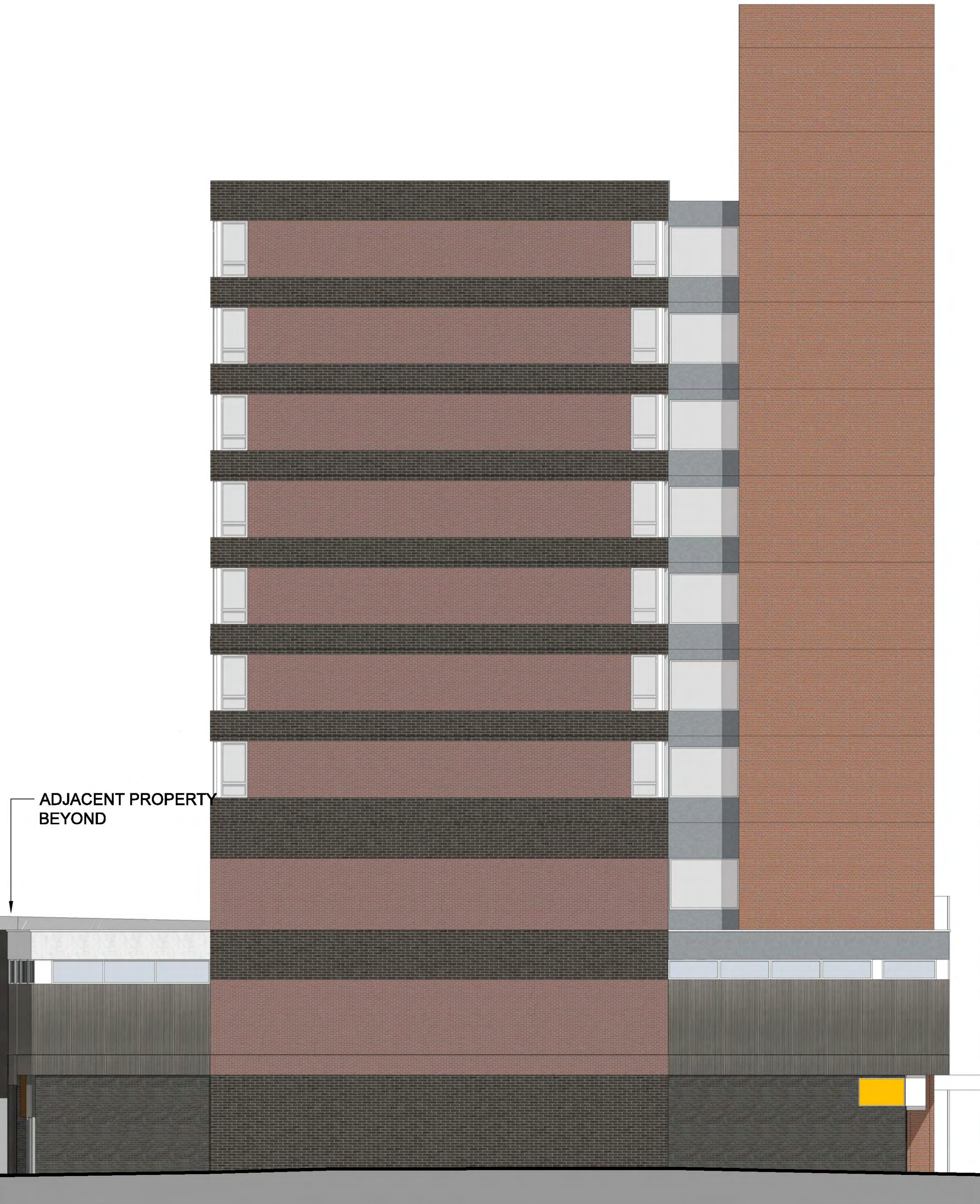
EXISTING SIDE (LEFT) ELEVATION SCALE 1:100 @ A1